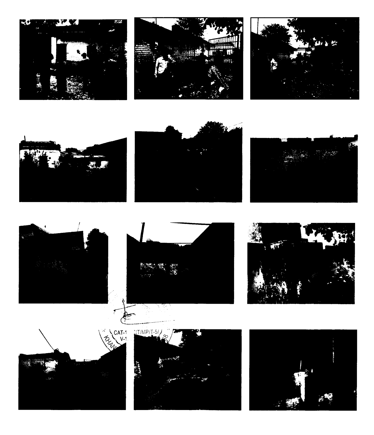
\underline{\textbf{Enclosure: -}} \ \textbf{Photographs of Property with its adjoining area}